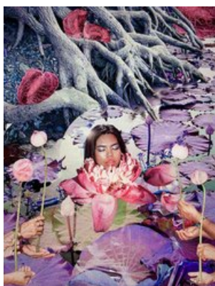
Untitled, From the Series Red Lotus (c) Karmonlak Sukchai / courtesy of the artist

The Foam Photography Museum in Amsterdam is one of the founders of Unseen Amsterdam. After a break of several years, the museum is now once again the content partner of Unseen Amsterdam 2020. Foam is not only contributing through its large international network of photography collectors and museum professionals, but also presenting a unique exhibition called ' Foam Talent ' at the Transformatorhuis.